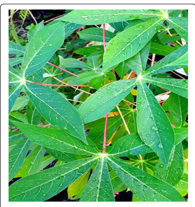
Fig. 2 Manihot esculenta Crantz. From: Richard Wong Garden & Woodwork In: Poisonous Yet Nutritious [64]. (http://rwgardenwoodwork.blogspot.com/2017/07/)

Inhibition of the mitochondrial membrane pore opening by the ethanolic extract of Manihot esculenta leaf was observed at intermediate concentrations in high-fat-diet-fed rat liver, at the lower concentrations in uni-nephrectomized,